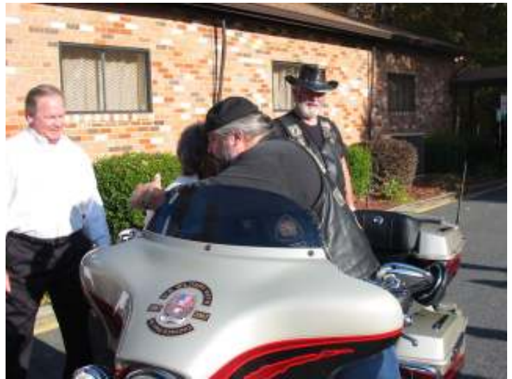
USMVMC President gives attendee a motorcycle ride.